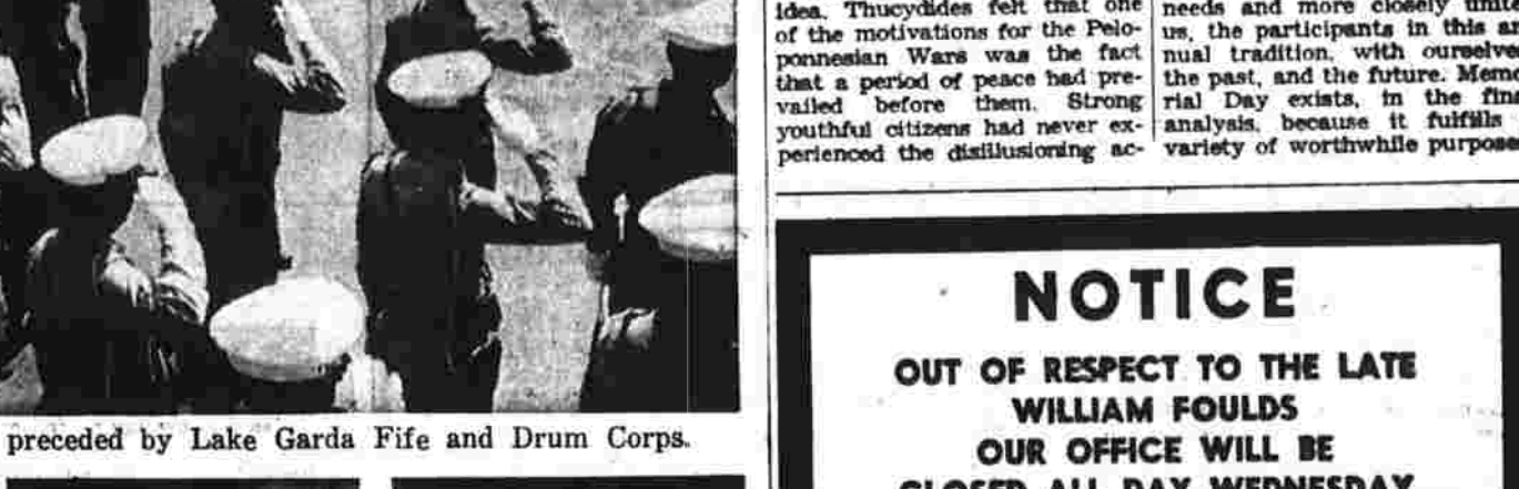
Army-Navy Club marching unit passes in review, preceded by Lake Garda Fire and Drum Corps.

A parade of 10,000 people viewed the Memorial Day parade in Manchester. The parade featured a variety of floats and bands.