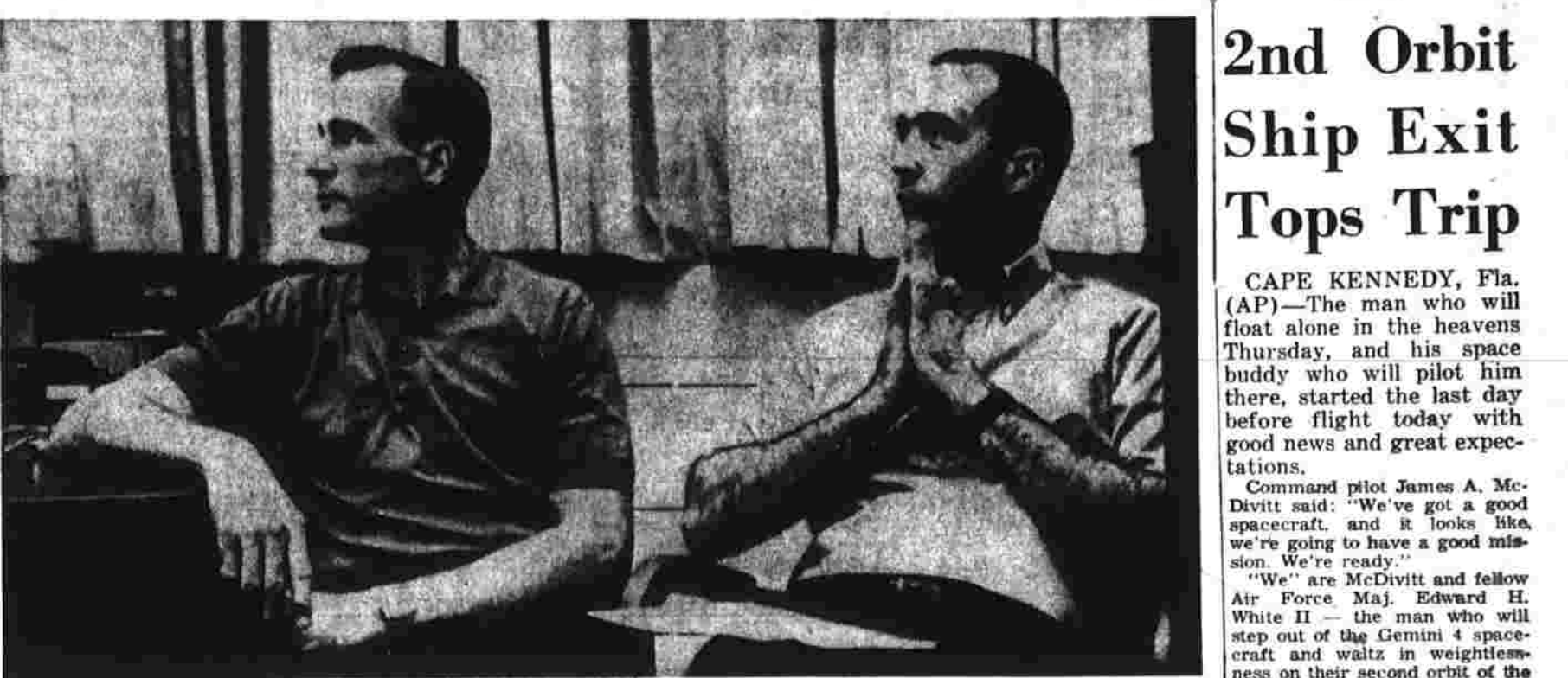
Astronauts Edward White (left) and James McDivitt After Their Final Physicals