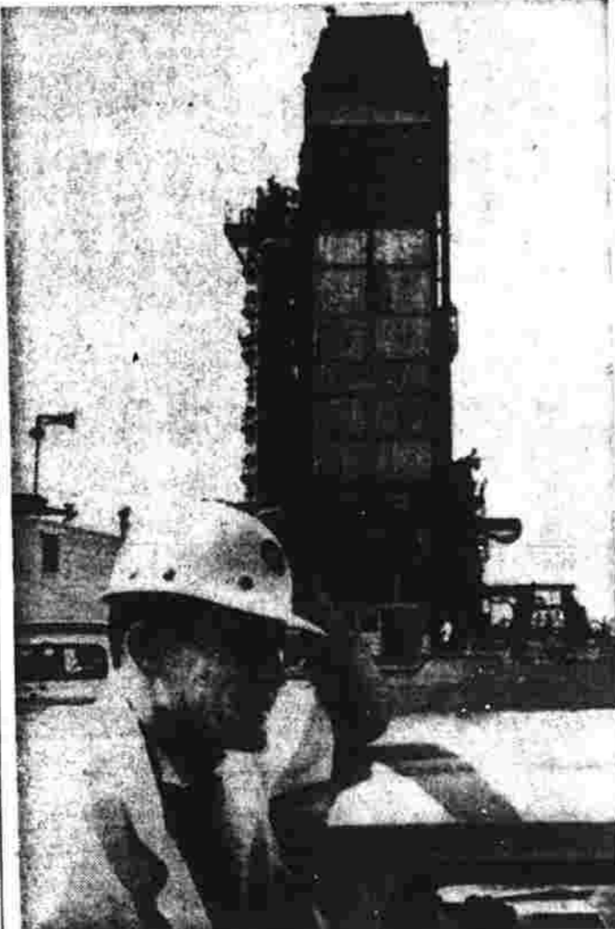
Astronaut Edward White stares into space at Cape Kennedy. He and James McDivitt are in final stages of preparation for their four-day orbital flight scheduled Thursday.